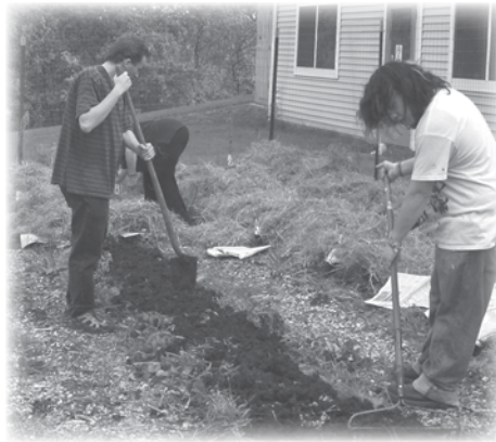
Students work in the garden.

Over the summer, produce was donated to a variety of charitable