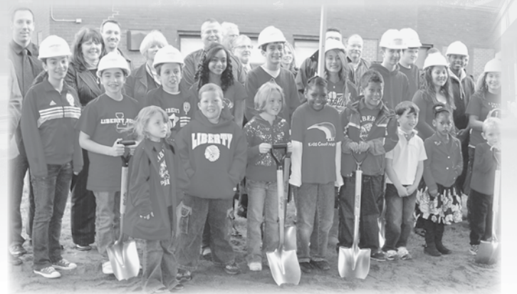
Participants in the groundbreaking ceremony

Liberty voters approved funding for the building project in 2007 and the district submitted its building plans to the State Education Department. The plans were approved, clearing the way for construction to begin at both the elementary school and high school. The Board of Education accepted bids for the project in July, and