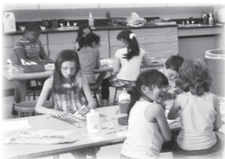
The new elementary art room