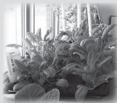
A classroom window garden

"It was a chance for them to eat and reflect on making healthy choices," said Kratz.